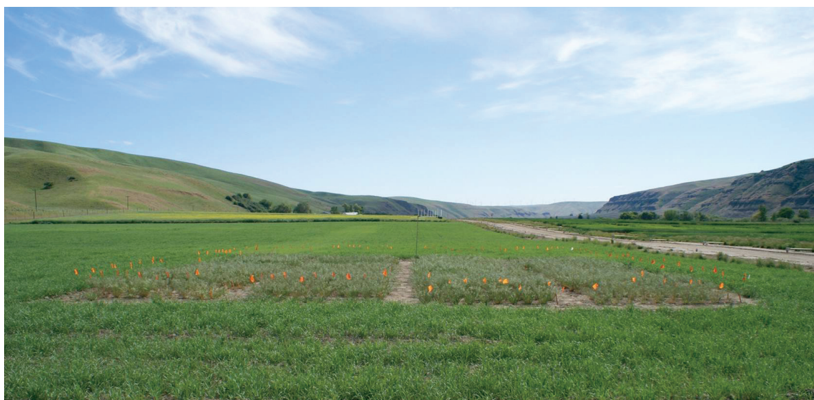
Figure 3. Downy brome common garden.

Further refinement of the downy brome development model could improve the accuracy and usefulness of future climate projections. Field studies are currently underway to incorporate greater spatial resolution of downy brome phenotypic variation. Additional work is also ongoing to incorporate historic climate changes as a covariate in the spatial analysis of current downy brome accession distribution.