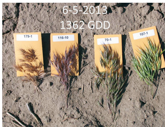
Figure 1. Downy brome variation in the Pacific Northwest.

advanced 10 to 30 days, depending on the model used. When models were averaged, the projected date advanced 15 to 25 days, depending on location. The projected calendar date to reach 1,000 GDD follows an east-west gradient across the projected region in all models. The eastern region of small grain production in the PNW is projected to have the least change, while the western region is projected to have the greatest advance in calendar date needed to reach 1,000 GDD.