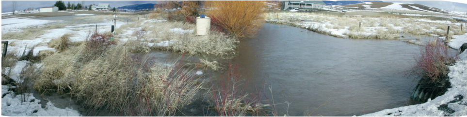
Figure 2. Water quality monitoring station at the outlet of the 2,930-ha Paradise Creek watershed.