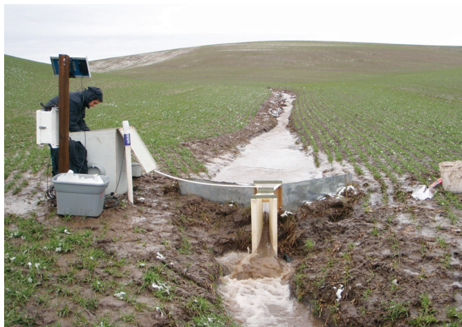
Figure 1. Water quality monitoring at the outlet of the 14-ha Idaho conventional tillage site.

While it is clear that carbon and sediment yields are declining in the Palouse Basin, the vast majority of the soil and carbon that is transported by erosion in the region is deposited and stored within the basin. Using a conservative soil erosion estimate of 3.3 tonnes/ha/year, the sediment yield data measured at the Hooper station indicate that less than 5% of all the carbon transport by erosion within the basin will be transported out of the basin. The