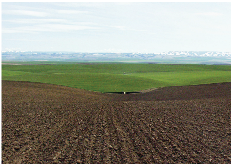
Figure 1. Conventional tillage (left) increases soil disturbance and oxidation of soil organic carbon (SOC) compared to no-till management (right).

N 2 O emissions constitute two-thirds of the winter wheat carbon footprint. No-till increases soil carbon sequestration in winter wheat drylands relative to conventional tillage, particularly on high rainfall areas. However, the dollar value of carbon credits resulting from reduced tillage is unlikely to be high enough to provide incentive for the adoption of reduced tillage practices. More efficient use of nitrogen fertilization can contribute to decreasing the carbon footprint independently of tillage management.