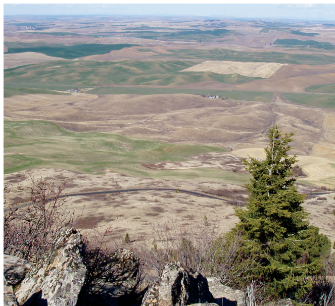
The northeastern part of the REACCH Region in Eastern Washington.

Experimental scientists and modellers from the U.S. Department of Agriculture-Agricultural Research Service, Oregon State University, University of Idaho, and Washington State University have been working closely together over the past