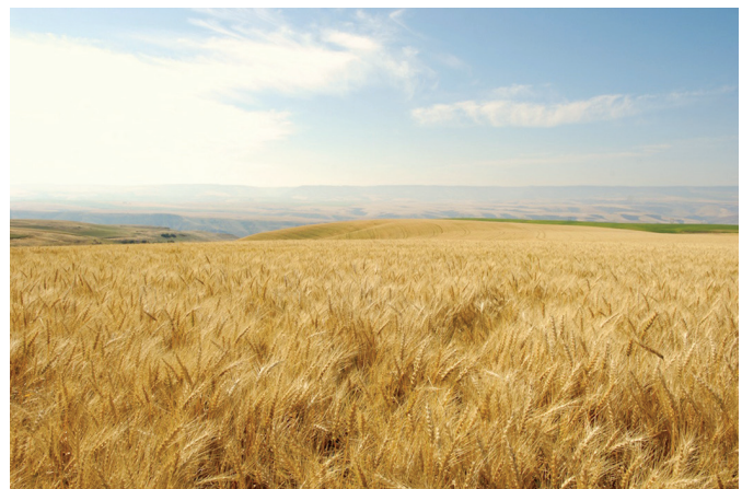
Ripe wheat ready for harvest.

In an effort to further facilitate the understanding of REACCH modeling results, we are developing a more comprehensive fact sheet introducing stakeholders to some of the fundamental considerations of interpreting environmental modeling results. We anticipate that this fact sheet will be available in spring of 2014 and will be available on the REACCH website.