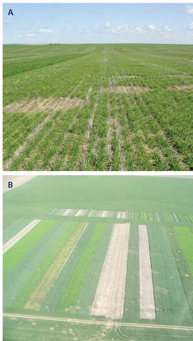
Figure 1. Bare patches caused by Rhizoctonia solani AG-8 in a long-term no-till cropping systems experiment near Ritzville, WA. (a) Spring barley (left) and spring wheat (right) during the juvenile growth period in early May 2003. (b) Aerial overview of one replicate of the large-scale experiment in early July 2006, at which point Rhizoctonia bare patch was in decline.

with spring barley (Figure 2). Additionally, the 18 year average grain yield for spring wheat in rotation with spring barley was significantly greater than for continuous spring wheat. Russian thistle ( Salsola tragus ), a troublesome broadleaf weed with a fast-growing taproot, was the only plant that grew within the patches (Figure 3). This is the first direct evidence of natural suppression of Rhizoctonia bare patch with long-term no-till cropping in North America. This suppression also developed in a rotation that contained broadleaf crops (yellow mustard and safflower) in all but five years of the study, and the suppression was maintained when safflower was added back to the rotation.