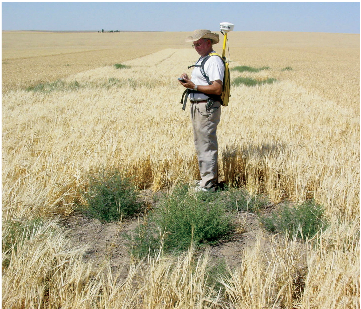
Figure 3. Russian thistle, shown here in spring barley, was the only plant that grew in bare patches. Its taproot was able to penetrate through the layer of Rhizoctonia inoculum to access soil water present beneath patches. Cereal and oilseed crops grown in the large-scale experiment did not send roots underneath the bare patches, thus leaving “islands” of stranded water.

*** Significantly different at P < 0.001 .