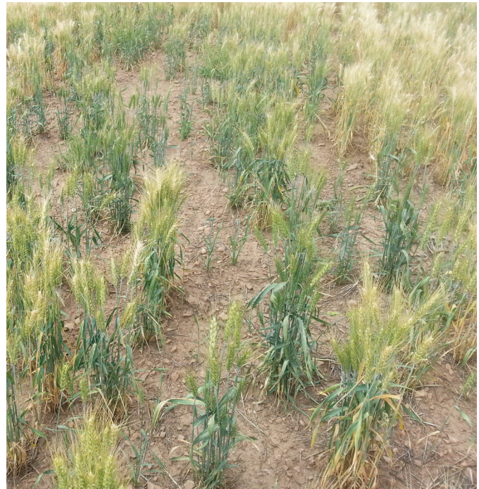
Figure 4. Wireworm damage in dryland wheat near Geneva, ID.