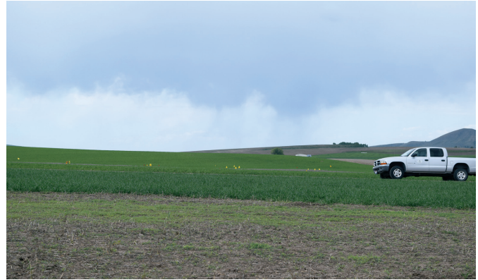
Figure 3. Wireworm chemical trials north of Ririe, ID.

This project is anticipated to lead to publishing a visual identification guide to the most common wireworm species as well as a species distribution map for ID. We will be presenting a series of workshops and talks designed to educate wheat and barley producers, county educators, and crop consultants about the pest and available management tools. As a part of our extension and outreach commitment, we are currently in the process of preparing an extension educational video.