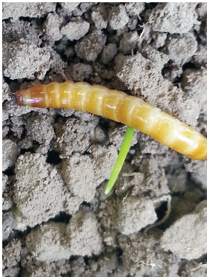
Figure 2. Limonius spp. wireworm burrowing into the soil.