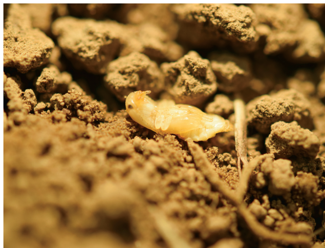
Figure 1. Click beetle pupae (Coleoptera: Elateridae).

Data collected during the past four months indicate that various wireworm species appear in the solar traps at different times. Multiple species may be present within the same field. Unexpectedly, the solar traps continued to attract wireworms in August and September in central and eastern ID. Our latest data indicate that the prevalent species collected in traps changed toward the end of the season. The majority of the collected species has been from the Limonius spp. group. Sample representatives of other species have been sent to Montana State University for species confirmation.