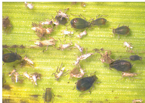
Figure 1. The bird cherry-oat aphid, Rhopalosiphum padi , on wheat leaves. These aphids transmit damaging viruses and can severely reduce wheat yields when populations are high.

The important findings of our work were threefold: (1) Populations of each cereal aphid species are apparently strongly regulated by strong feedbacks: as aphid densities in a given year rise, aphid densities in the following year are likely to be considerably lower, and vice versa. (2) A combination of climate variables and population models were used to construct predictive models of inter-annual aphid density and population growth rate, with strong models developed for population growth rate in the case of