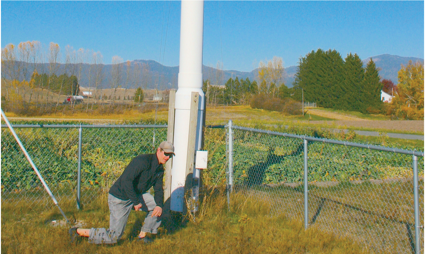
Figure 3. A suction trap located near Moscow, Idaho.

scale; rather, certain species were highly responsive to climate, and others were not. Under projected warming, we predict that D. noxia will become less prevalent in the region, whereas M. dirhodum abundance is likely to increase if annual precipitation rises. Irrespective of climate variability, we expect that R. padi is likely to persist as a pest of cereal grains in the northwestern United States.