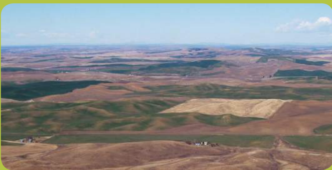
Variations in soil depth, organic matter, moisture can impact crop performance within a field, especially on hillslopes.

Precision agriculture is also referred to as site-specific farming. Simply, it allows farmers to address field variability (below), rather than treating the whole field the same. Because fields are rarely uniform, crops often have different needs depending on where they grow. For example, erosion on hilltops reduces soil quality and reduces crop yield. Crop yield will remain low on the hilltops regardless of how a farmer manages, easily rationalizing application of less fertilizer to that location and allocation of more to other places in the field with higher yield potentials. Similarly, precision equipment allows farmers to treat patches of weeds and diseases, rather than spraying the entire field. Applying inputs only where they will be used by the crop reduces costs, decreases losses, and increases efficient use of resources.